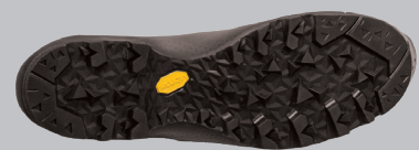
Outsole: Vibram Integral Light